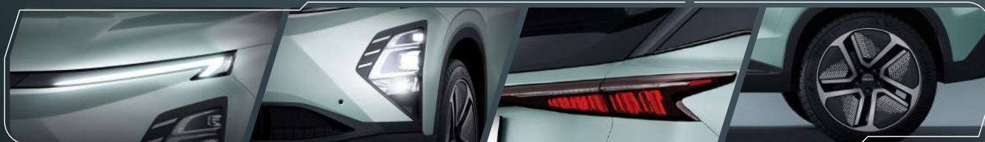
LED DRL Daytime Running Lamp