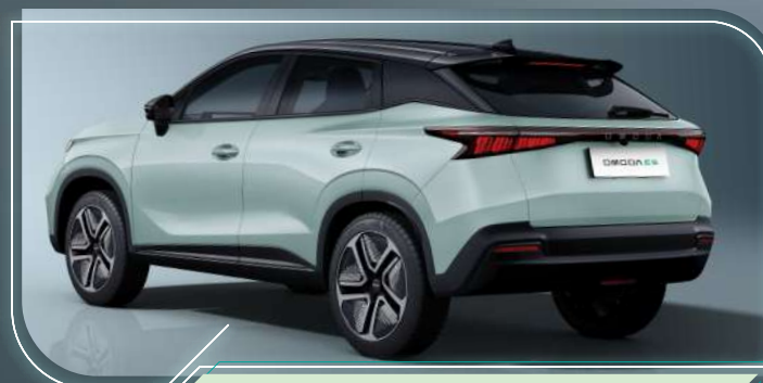
Light & Shadow Streamline Body