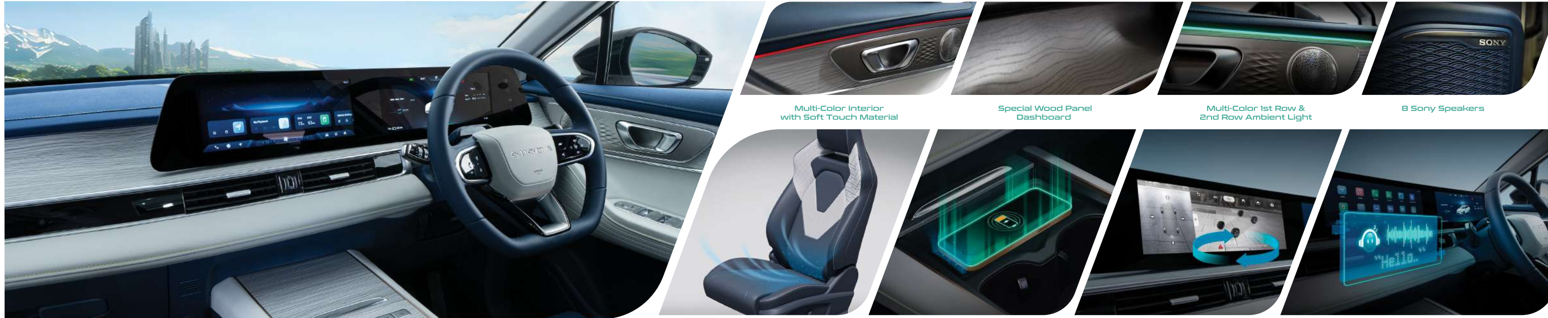
Multi-Color Interior with Soft Touch Material