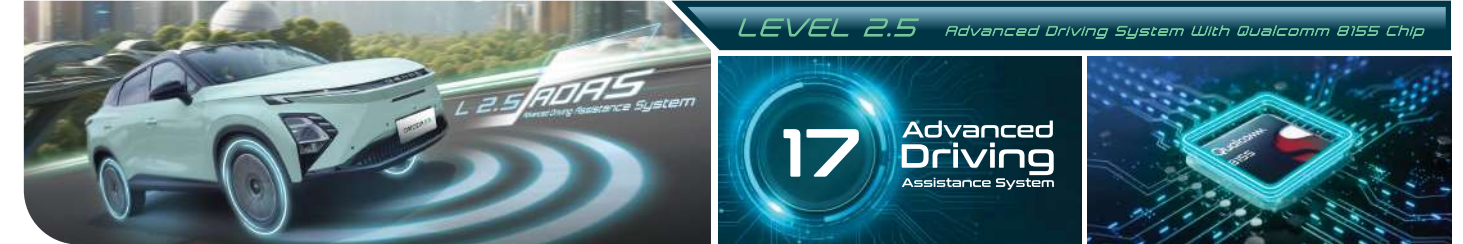
LEVEL 2.5 Advanced Driving System With Qualcomm B155 Chip