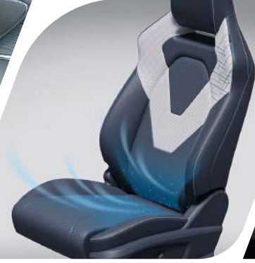
Driver & Passenger Ventilated Seat