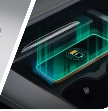
50w Smartphone Fast Wireless Charger with Cooling System