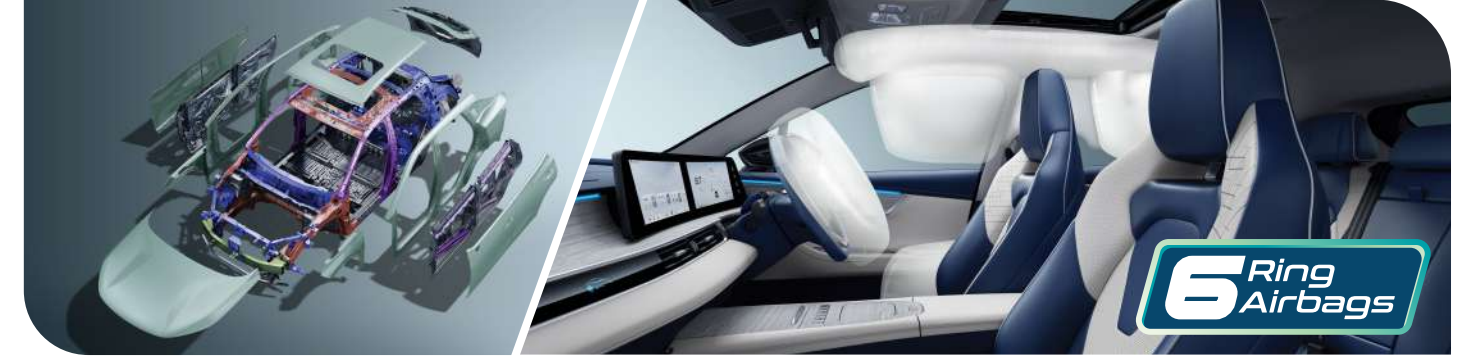
78% High-Strength Steel Body with Collision Dampening Point