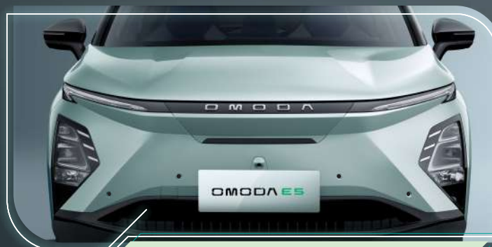
X Future Tech Front