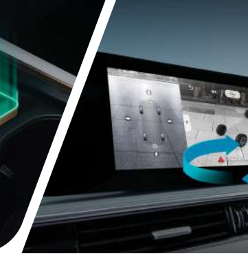
540° HD Panoramic Camera